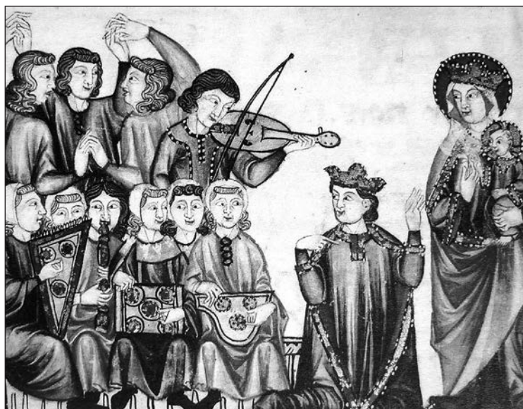
[Musical entertainment in the 13th century]